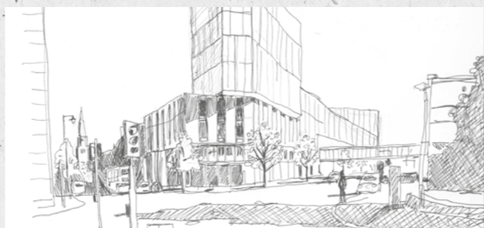
Ulster University