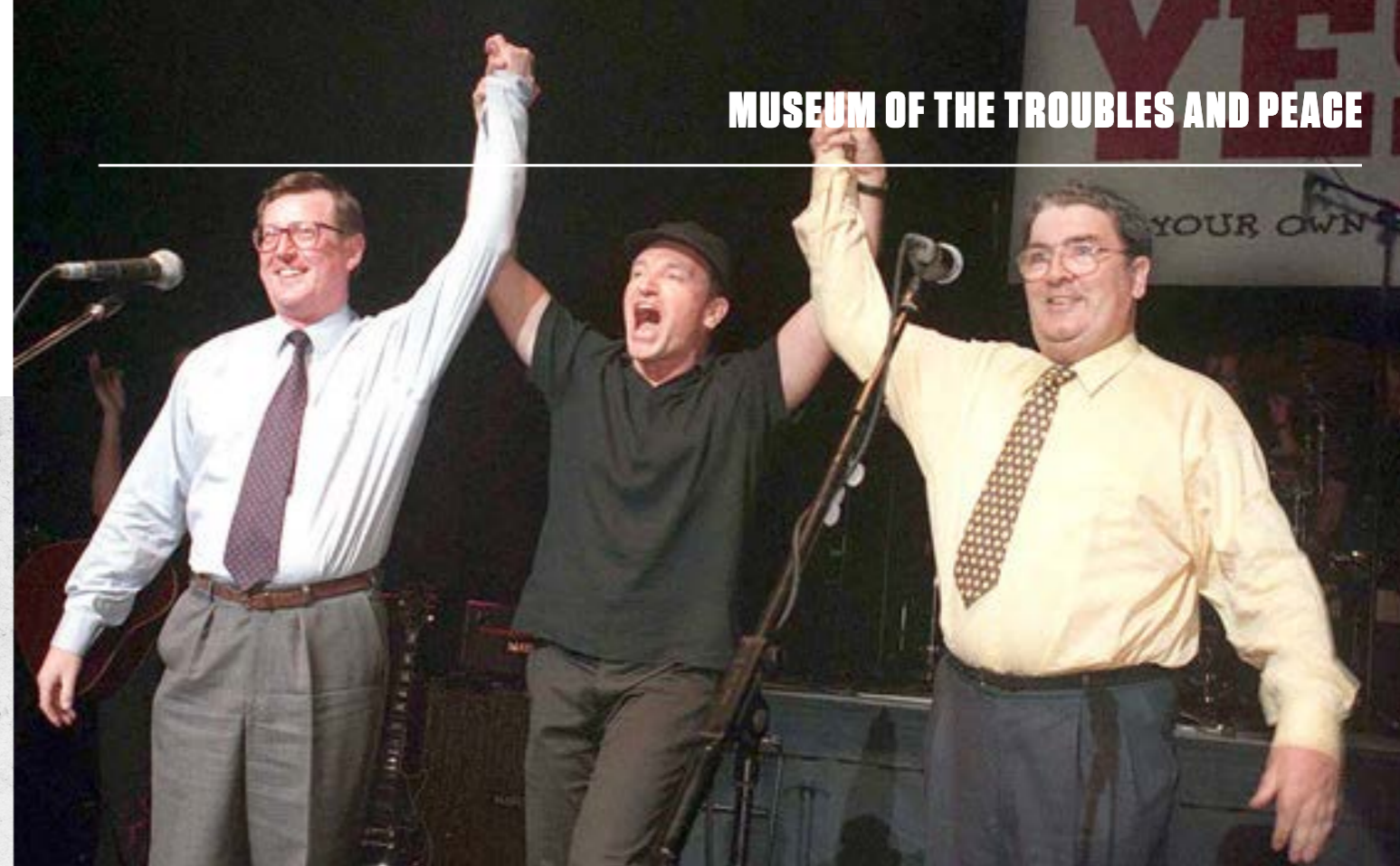
Celebrating the Belfast Agreement, David Trimble, John Hume, with Bono of U2, 1998