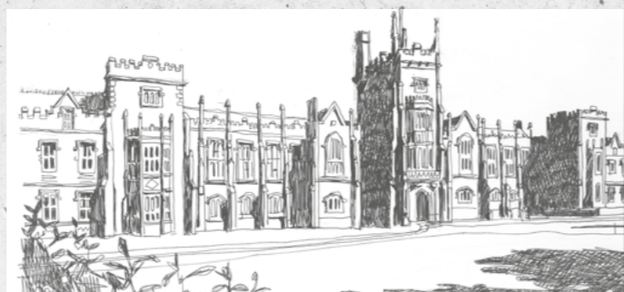
Queen’s University Belfast

The intellectual and professional resources to plan and implement MoTaP are readily to hand. These include the Senator George Mitchell Institute for Global Peace, Security and Justice, the Institute of Irish Studies, the Centre for Public History at Queen’s University Belfast; the International Conflict Research Institute (INCORE) and the vast digital repositories of ARK (NI Social Policy Hub) and CAIN (Conflict Archive on the Internet) at Ulster University; the Linen Hall Library, Belfast; the Belfast Newspaper Library; BBC and UTV archives, the UK and Ireland museum sectors; as well as the international connections of many of these institutions.