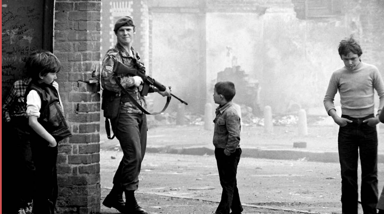
What's it all about? (Pacemaker Press)