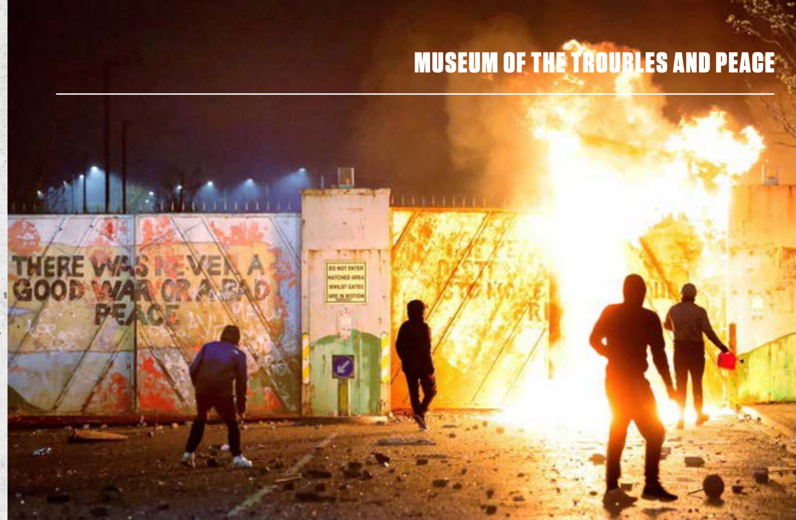
Rioting at Lanark Way, Belfast

Leading travel publications such as Trip Advisor and Lonely Planet raved about Belfast in the pre-Covid times. There is every reason to believe its vibrant growth as a tourism destination will resume in the years ahead. If the North is known world-wide for one thing, it is the Troubles (followed by Titanic). So, an ever-widening flow of international travellers to MoTaP is to be expected. Some of these will be tourists, in the usual sense. Others will have an interest in learning in more depth about the Troubles and the Irish peace process.