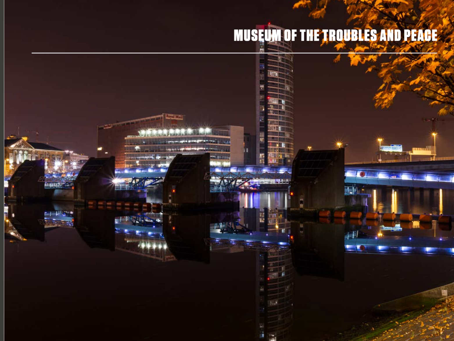
Belfast Waterfront at night.