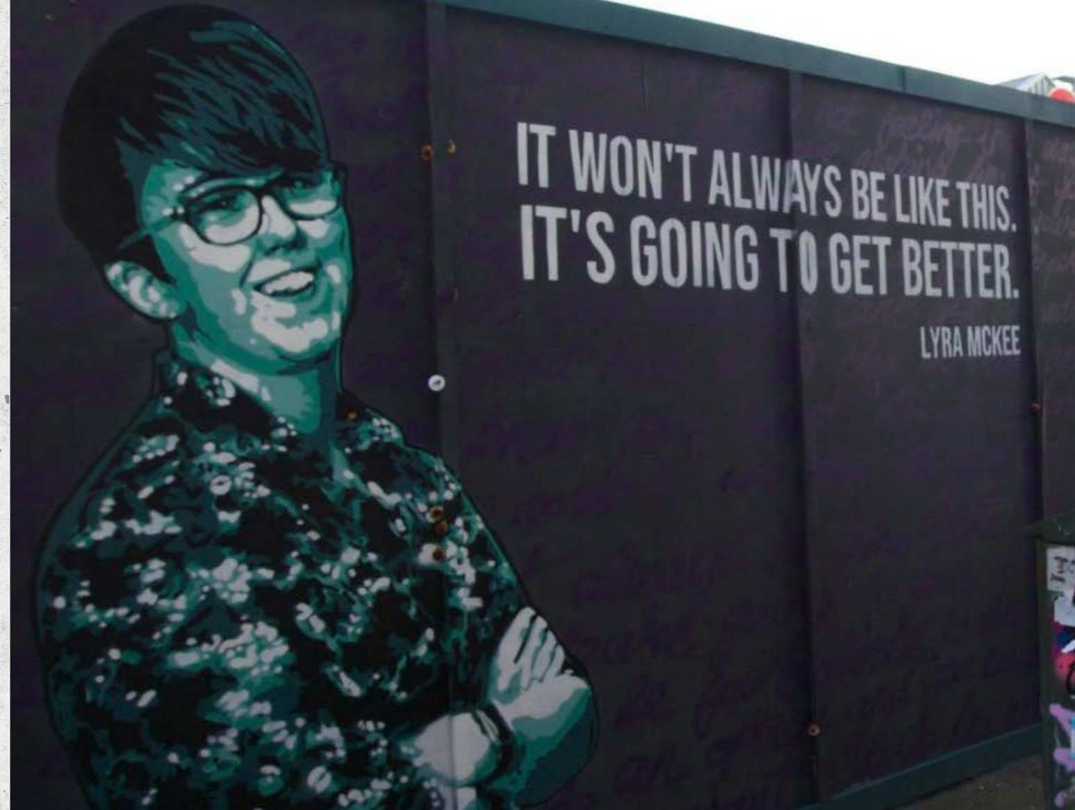
Lyra McKee, journalist and writer, fatally shot during rioting in Derry/Londonderry, April 2019

Morning Ireland